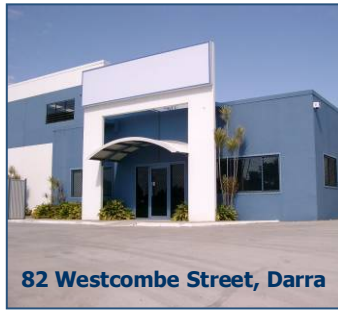
82 Westcombe Street, Darra

CVIAQ are pleased to announce that with the sale of 12 Swann Road Taringa, we will be relocating to leased premises at 82 Westcombe Street Darra. Due to some minor office refitting, the date for relocation is unconfirmed. It is expected that the office will be operational in time for the Annual General Meeting on the 18 th October 2006.