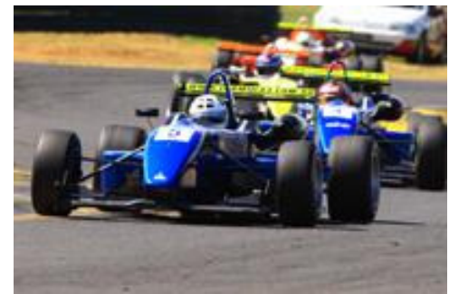
Morgan Park Raceway - Warwick Qld.